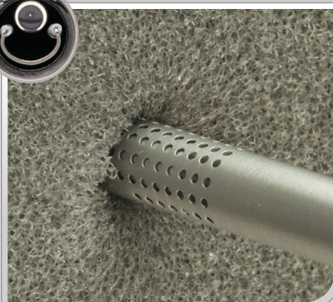
7 mm Princess Resectoscope