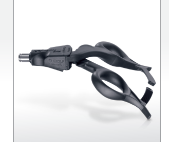
ERAGON axial handle with ratchet lock, not rotatable 83930085