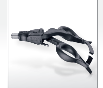
ERAGON axial handle with ratchet lock, with HF connector 83930084